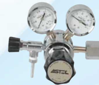
Gas Regulator IM-055