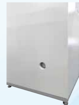
Standard equipped with Access port