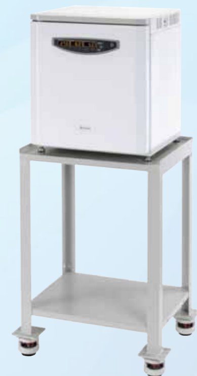
Space saving cart is available for both 30L and 50L AP30STD / AP50STD