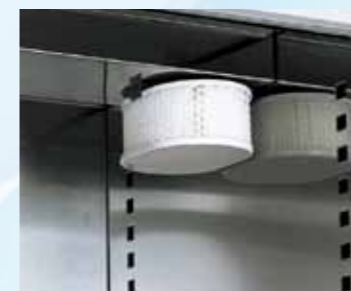
Air Filter IF-30 or IF-50 Air Filter (Half thickness) IF-30T or IF-50T