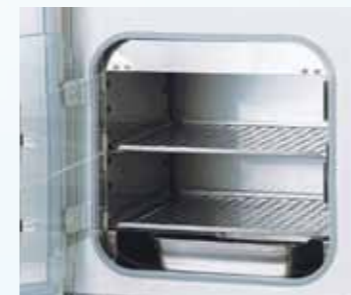
Inner Acrylic Doors (AP-100-2)

Inner Glass Doors (GAW-30AQS and GAW-50AQS) for extra security and limited access windows for preserving the gas levels and temperature inside.