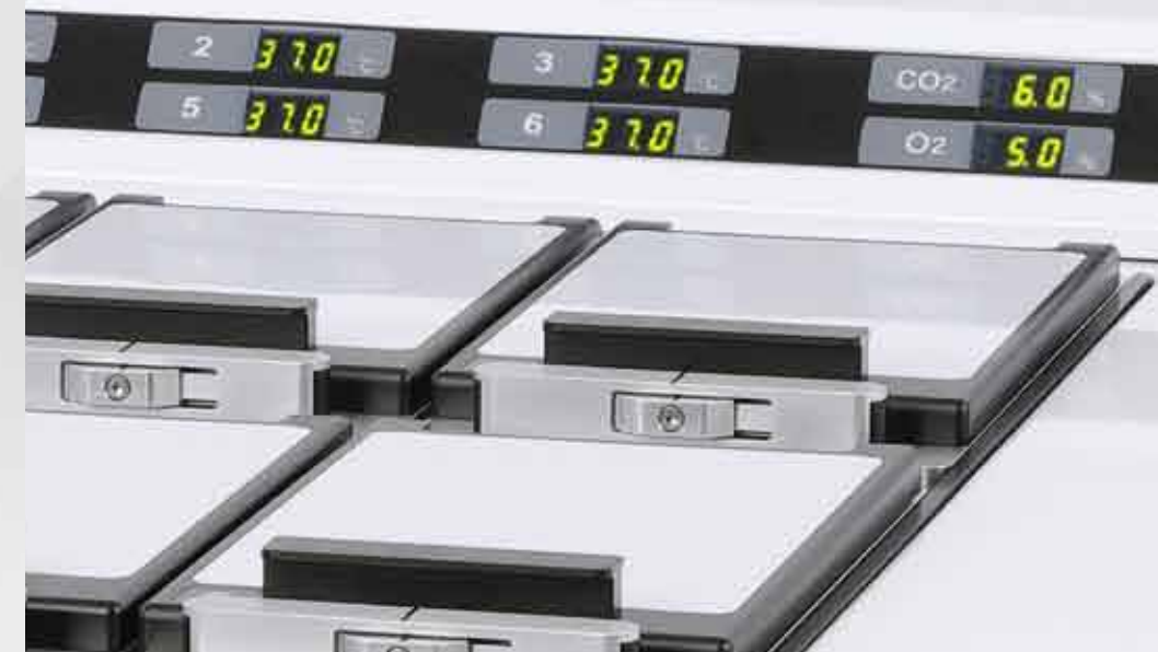
6-independent Culture Chambers with heated lid and bottom surface. Opening a chamber has no effect on the other unopened chambers.

We are obsessed with the precision. With digital PID temperature controls to the accuracy of \pm 0.1 C, advanced gas-control algorithms and high precision long-life Zirconia Dioxide Ceramic O 2 and IR CO 2 sensors, the EC6S-MD offers you Industry leading optimal environment management around your precious cells.